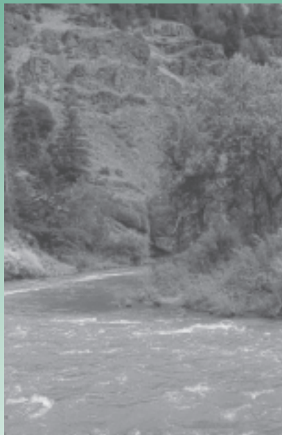
If proposed buget cuts take effect, most projects, like Tieton River Canyon, will not receive funding

Photo of a project that would not make it without the $55 million funding? Blurb under photo: With a budget appropriation of $55 million to the WWRP, the X project would provide X to X (focus on parks or habitat?)2003 Legislative Alert The Governor's 2003 Budget and the Coalition's Recommendation of $55 Million by Joanna Grist, Executive DirectorPhoto of a project that would not make it without the $55 million funding? Blurb under photo: With a budget appropriation of $55 million to the WWRP, the X project would provide X to X (focus on parks or habitat?)2003 Legislative Alert The Governor's 2003