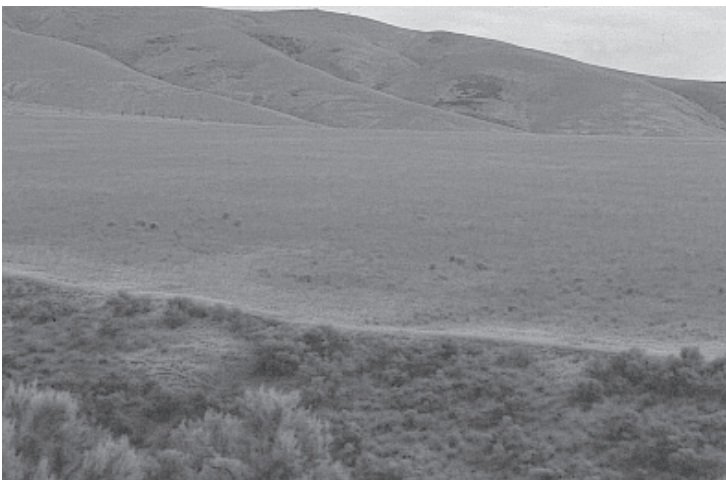
Rattlesnake Slope Addition: If proposed cuts are approved this will be one of the few projects funded

The Squalicum Fields project addresses both the need for more recreational opportunities in an underserved part of Bellingham and the need to preserve riparian lands and the Squalicum Creek, the City’s most productive salmon stream. The proposed site is located in northwest Bellingham in the center of an urban area. Trails in the site will connect nearby neighborhoods and expand on the existing park and trail system.