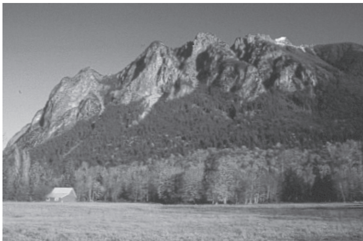
Mt Si, NRCA: Proposed cuts would allow only partial funding of this project, the rest of projects in this category would receive no funding