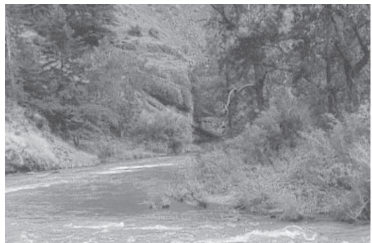
Nisqually Mashel, State Park: budget cuts would prevent the acquisition of this property