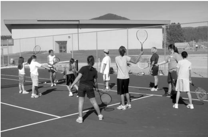
City of Chewelah

Sumas received nearly $500,000 in WWRP matching funds to add more ball fields and trails to Bowen Field. The park is in Sumas' center, giving access to local businesses and allowing residents to walk to it.