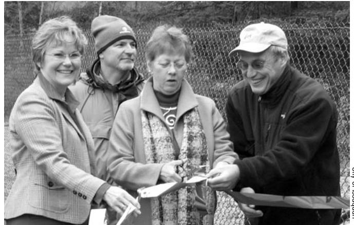
City of Issaquah

soccer field were created at Barbour Recreation Complex and will be shared by the community and the school district.