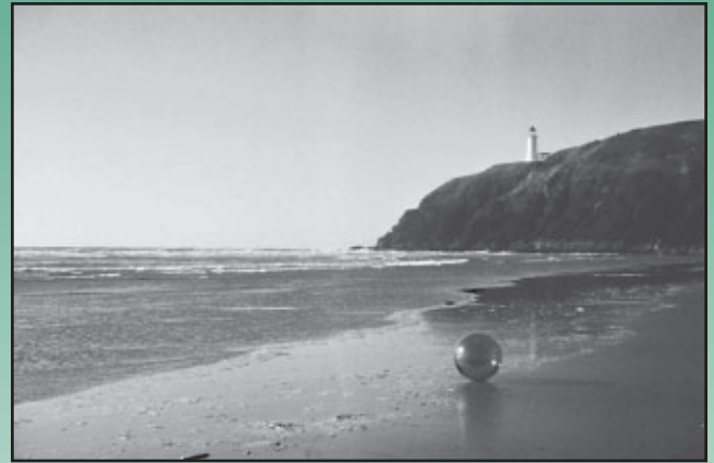
WA State Parks

The Commissioner also pointed out the importance of trails like the Iron Horse Trail, which is used by bicyclists and horseback riders and stated "trails connect people and communities." The WWRP Grant Program funded over $8 million in state park