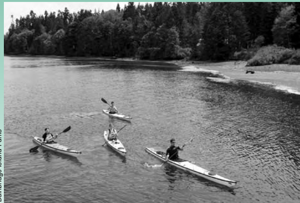
Bainbridge Island Parks

Water Access: Blakely Harbor, So. Lake Union Park, Tim's Pond, Meydenbauer Bay Waterfront