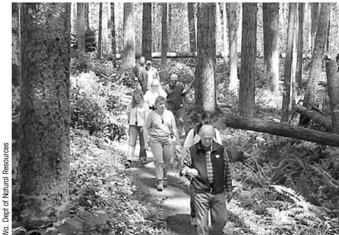
Wa. Dept of Natural Resources

With the support of the Rocky Mountain Elk Foundation, Wa. Dept. of Fish and Wildlife requests a total of $2.3 million in WWRP funds to protect 4,640 acres that are threatened by development. A wide variety of species including steelhead, bull trout, elk, mule deer and golden eagle are supported by the diverse wetland, shrub steppe, oak woodland, cliff and talus habitats.