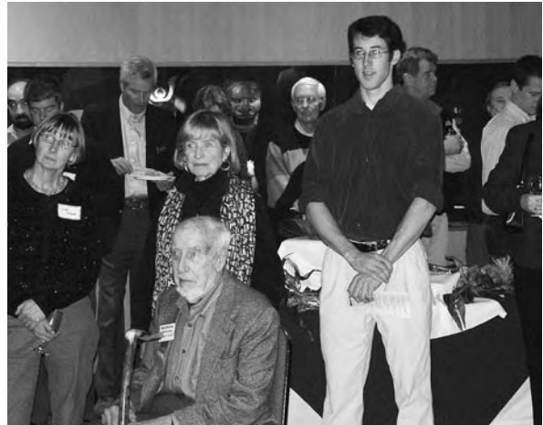
Event guests enjoyed a presentation on some of the 700 parks, trails, beaches and wildlife habitat areas protected with funds leveraged by the Coalition.

Bainbridge Island Winery • Cascade Designs REI • Sun Mountain Lodge Subhankar Banerjee • Sunny Walter