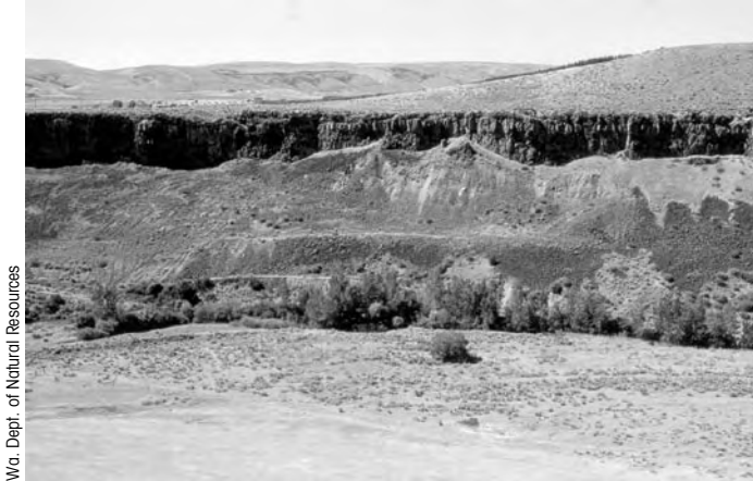
Wa. Dept. of Natural Resources