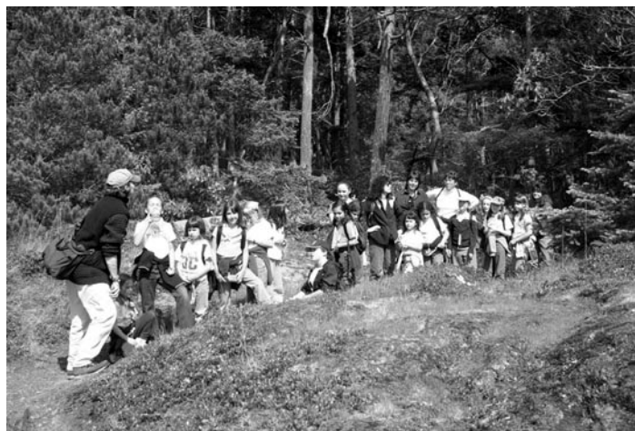
Wa. State Parks

Barbour Recreation Complex, Chewelah Bowen Field, Sumas Bradley Lake Park, Puyallup Bremerton Skatepark Burlington Northern Landing, Skagit Co.