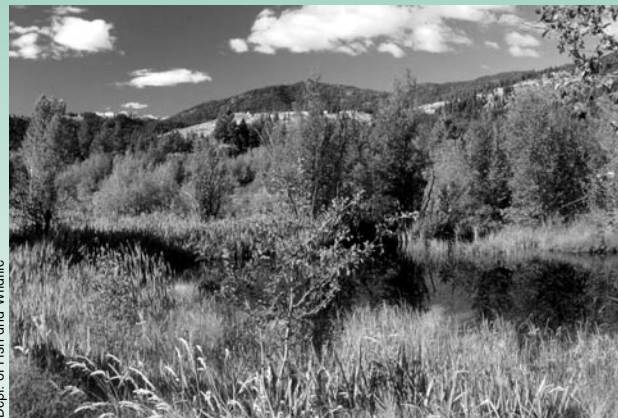
Dept. of Fish and Wildlife

We are asking the Governor and your legislators to support $100 million for WWRP grants next legislative session.