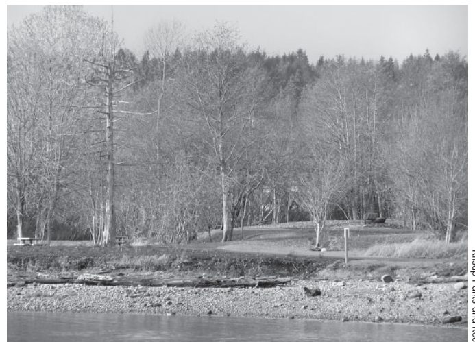
Kitsap Parks and Rec.

After a decade of work, Silverdale residents can enjoy picnics and waterfront strolls at the recently dedicated Old Mill Park. The Coalition leveraged over $450,000 to protect seven and a half acres of wetlands, salt-