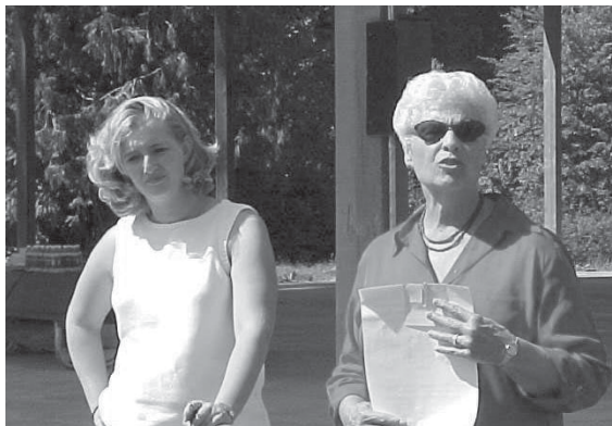
Sultun Parks and Rec.