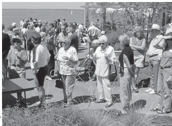
Bellingham Parks and Rec.