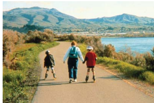
WWRP funds helped Wenatchee develop four miles of trail, parking and restroom facilities for the Apple Capitol Recreation Loop Trail.