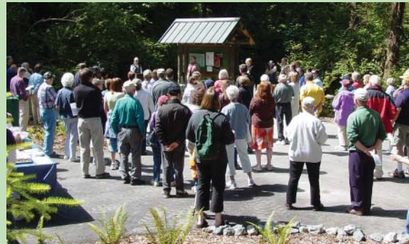
Founding Co-Chair, Governor Mike Lowry, spoke at the dedication of Eagle Landing Park in Burien.