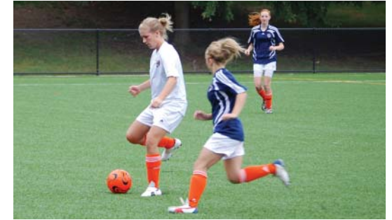
More soccer teams are using Auburn's Game Farm Park fields now that they have been improved with WWRP matching funds.