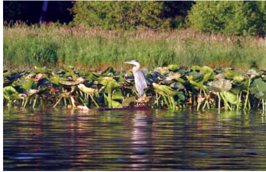
Spokane County used WWRP funds to create public access to Newman Lake so visitors can swim, canoe and view wildlife.